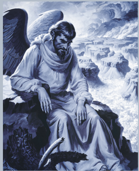
Satan is forced to remain on a desolate earth with no one to tempt for 1000 years.

Let's outline, in chronological order, what transpires prior to, during and after this millennium: