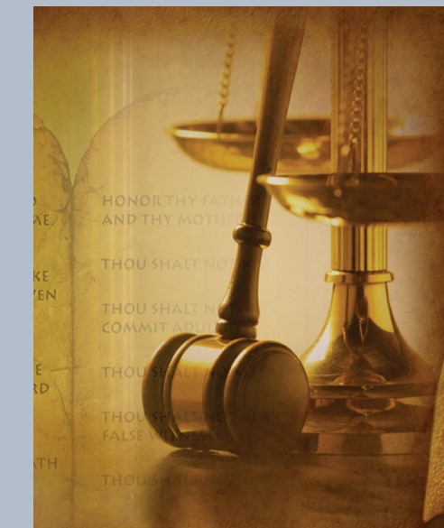
The Bible indicates that some sort of judgment takes place before the Second Coming of Christ.

On the day he was to be hanged, he was served a meal of peas, bread, olives and tea. As midnight approached he was led to the gallows. He was pronounced dead at 11:58 pm., May 31, 1962. His body was cremated and his ashes strewn out at sea. The executioners? Jews. The criminal? Adolph Eichmann – the man who orchestrated Hitler’s systematic murder of millions of Jewish men, women and children. However, was there really justice in hanging someone who killed millions of people? No, not really. Only God can provide that kind of justice. The Bible says He will do just that: “For God will bring every work into judgment, with every hidden thing, whether it be good, or whether it be evil.” (Ecclesiastes 12:14; 2 Cor. 5:10)