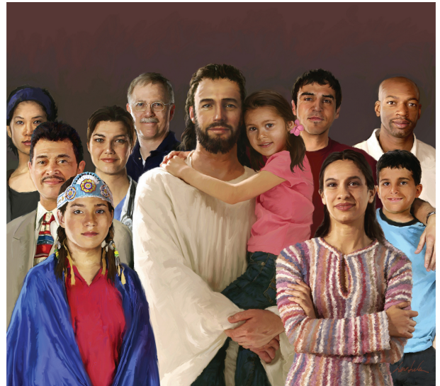
God’s church loves Jesus and keeps His commandments.

So we see that God’s message for the world is salvation by accepting Jesus as our Savior. Then, from a grateful response of love to our Lord, we are called to obey His Commandments. So how can we recognize God’s last church? By the message it presents.