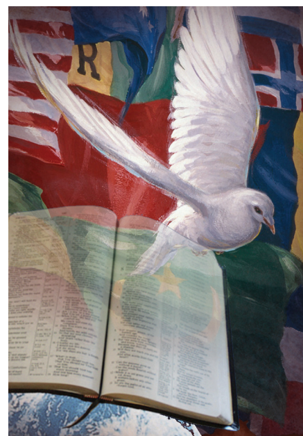
"This gospel of the kingdom shall be preached in all the world."