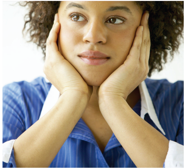
The Holy Spirit is the voice of conscience in people.

The promised Spirit will lead you into all truth. He will comfort and guide you. He will gift you for good works and the strengthening of His church. He will convict you of sin and give you power over sin. Won't you open your heart now to Jesus and His promised Spirit?