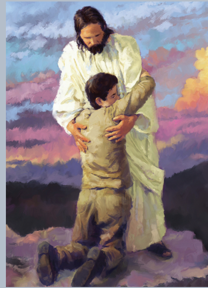
God's people keep the commandments of God and have the "spirit of prophecy" among them.

As Seventh-day Adventists, we believe in these texts about an end-time people who keep the commandments of God, who have the faith of Jesus, and who have the testimony of Jesus, which is "the spirit of prophecy." We believe that this gift has been manifested in the life and writings of Ellen G. White. Please note, that in all these meetings we have never once gone to the writings of Ellen White as a point of authority for any teaching. We have gone consistently to the Bible. Everything needs to be tested by the Bible. It is our ultimate authority!