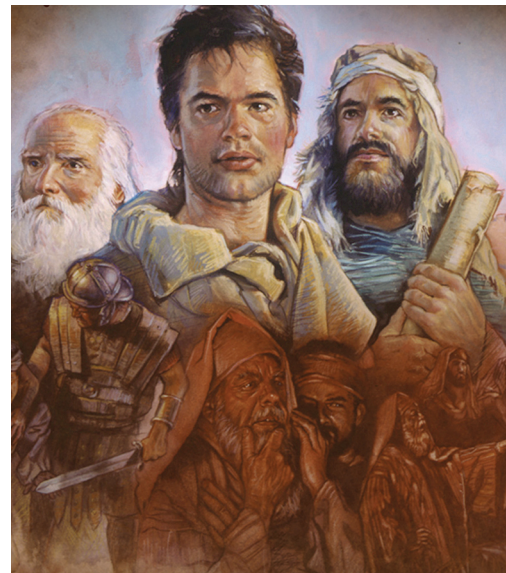
The testimony, or words, of Jesus have always been communicated to man through the prophetic gift. All prophets must pass the test of scripture on both their life and message.