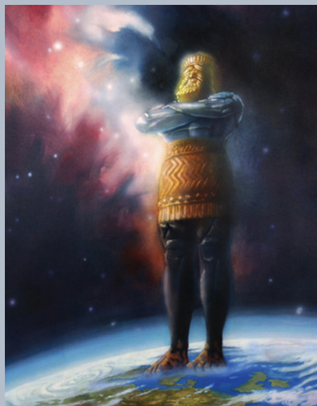
The image of Daniel chapter 2 gives a panoramic view of history.

In the dream, Daniel saw an image whose head was made of gold. Its chest was of silver and its thighs of bronze. Its legs were of iron and its feet partly of iron and clay. These metals represented a succession of kingdoms as shown in the illustration to the right.