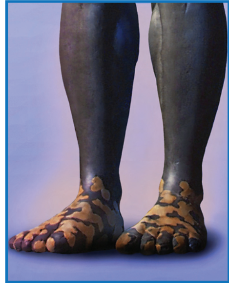
The Roman Empire would never be united.

Napoleon, Kaiser Wilhelm and Hitler have tried to