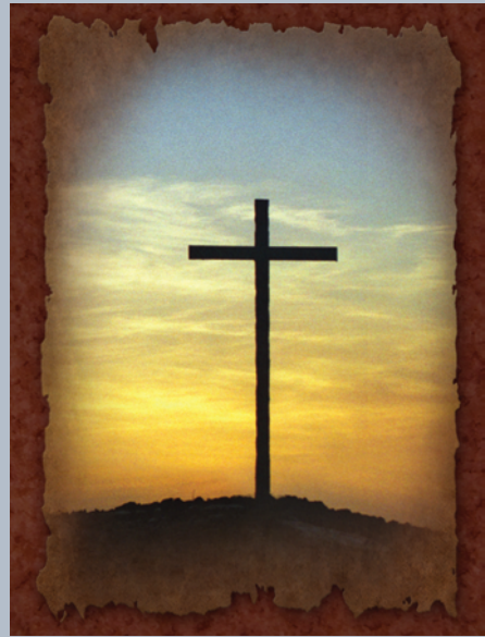
For millions around the world, the cross of Christ has led to eternal life.

Hebrews 1:1-3 says: “God, who at various times and in various ways spoke in time past to the fathers by the prophets, has in these last days spoken to us by His Son, whom He has appointed heir of all things, through whom also He made the worlds.”