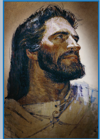
Jesus taught "The Sabbath was made for man."

What about the text that says: "And upon the first day of the week, when the disciples came together to break bread, Paul preached unto them, ready to depart on the morrow; and continued his speech until midnight." (Acts 20:7) Doesn't this refer to a Sunday service? It appears this was a Saturday night meeting. For the Jewish writer Luke, Sabbath sundown would have marked the beginning of the first day of the week. Also, the fact that it was the first day of the week would have given the author of Acts a great opportunity to talk about any change. But he says nothing. (In our next presentation we will explore how the change from Sabbath to Sunday took place).