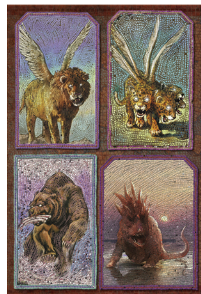
Daniel 7's beasts represent four kingdoms