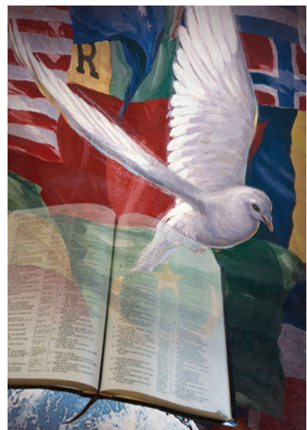
"This gospel of the kingdom shall be preached in all the world."