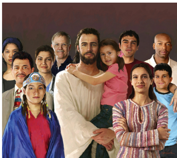
God’s church loves Jesus and keeps His commandments.

Don’t expect that the church that loves Jesus and preaches the everlasting Gospel to the world and keeps all of His commandments will be the most popular one in your neighborhood. The issue for us is not to follow the crowd. Rather, it is to follow Jesus and His Word, the Bible. Won’t you choose to be a part of Christ’s last day, commandment keeping people?