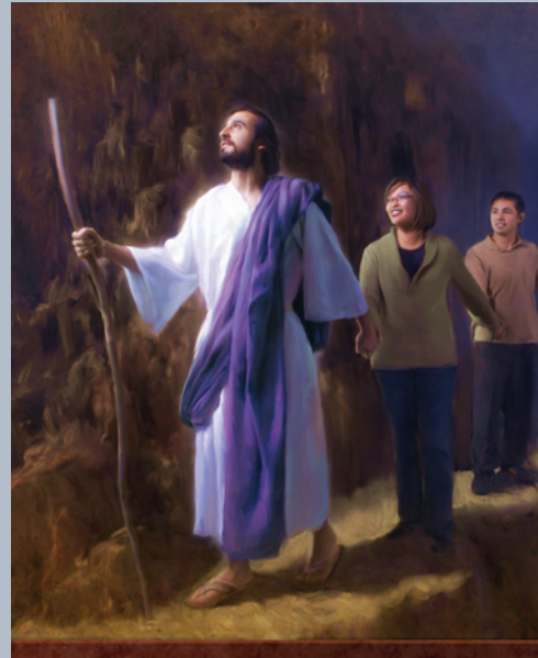
God's people have chosen to follow Him regardless of what man might try to do to them.

This issue of worship is going to center around the commandments of God, particularly the fourth commandment, and the 7th day Sabbath, which points to God as our Creator. You will remember that this beast power has thought to change that day to Sunday, as a mark of its own power and authority.