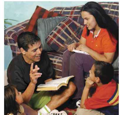
God’s principles of love can make your home a little heaven on earth.

Will you commit to build a home where Jesus is the center of everything? Will you be a part of a home which chooses daily to follow the Lord? Will you as husband and wife join hands in a pledge to make your home a haven of love? Remember, that marriage (and a family) still takes three - husband, wife and the Lord of love, Jesus Christ!